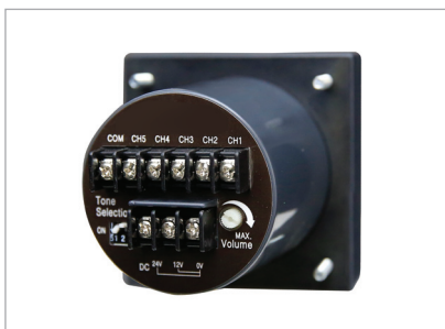
Terminal box for power and sound (back side)