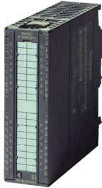
SIMATIC S7-300, Digital input SM 321, isolated, 32 DI, 120 V AC, 1x 40-pole