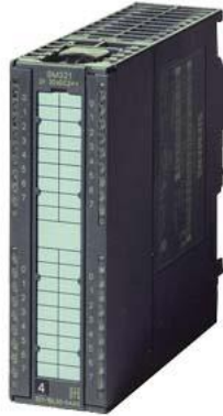
SIMATIC S7-300, Digital input SM 321, isolated, 8 DI, 120 V/230 V AC, 1x 40-pole, with single routing/channel