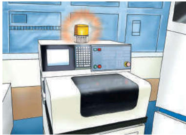
CNC machine equipped with S125U