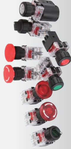
Flush plastic guard (MR□ - K)