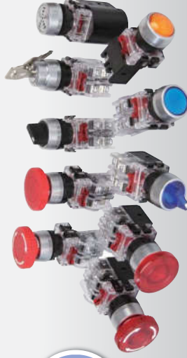
Extended aluminum guard (MR□ - R)