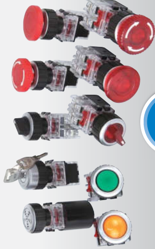
Flush aluminum guard (MR□ - A)