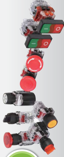
Extended plastic guard (MR□ - T)