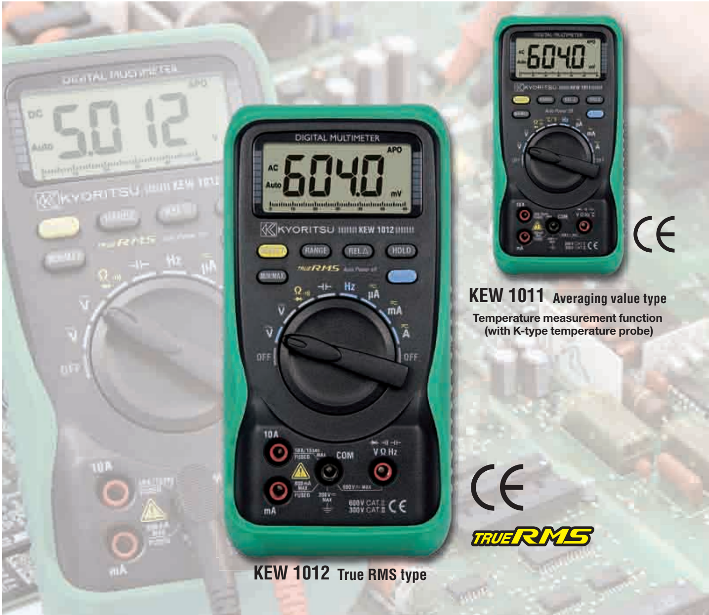
KEW 1012 True RMS type