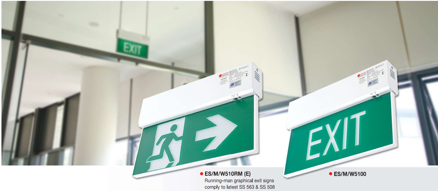
● ES/M/W510RM (E) Running-man graphical exit signs comply to latest SS 563 & SS 508

SMT LED with lifespan 50,000 burning hours SMT LED surface mount emergency exit light