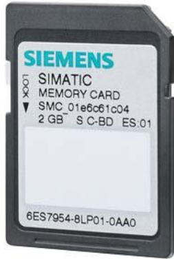
SIMATIC S7, memory cards for S7-1x 00 CPU, 3, 3V Flash, 2 GB