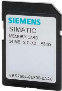
SIMATIC S7, MEMORY CARD FOR S7-1X00 CPU/SINAMICS, 3,3 V FLASH, 24 MBYTE