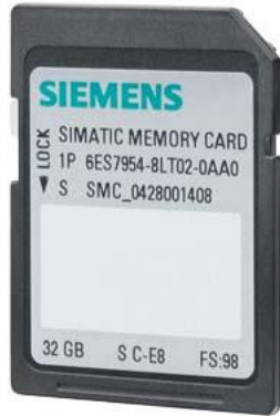
SIMATIC S7, memory cards for S7-1x 00 CPU, 3, 3V Flash, 32 GB