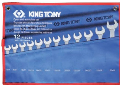
► MRN / SRN : Teton pouch bag