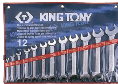
► MR / SR : Nylon pouch bag