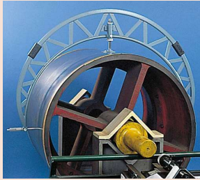
Standard Accessories Spanner (200154), 1 pc.